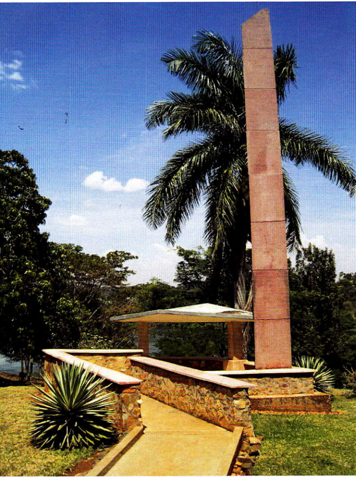
Historical Speke Monument (1862)

In 1863, John Hanning Speke sent a celebrated telegram from Khartoum to the Royal Geographical Society, and the expectant western world, that the question of the Nile was settled. He had previously asserted, on a hunch, that the lake he named Lake Victoria in 1858 was indeed the Source of the Nile . His claims were made more compelling by his second exploratory journey in 1860 which brought him to the exact spot of the Speke Monument at Living Waters Resort on 28 July 1862 and led him further down the Nile to Khartoum from where the telegram was sent. His hunch proved to be right.